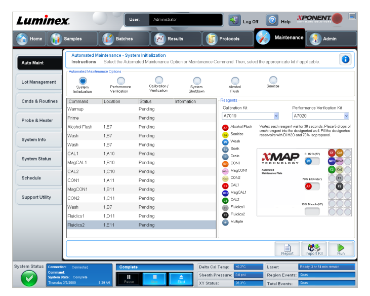
Automation of routine operations reduces system hands-on time.